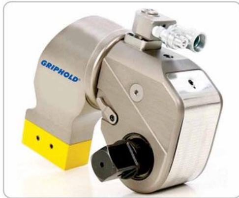
Square Drive Hydraulic Torque Wrench